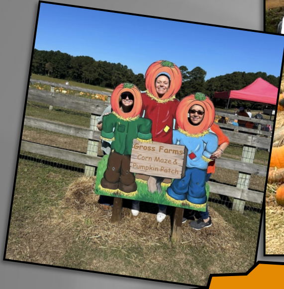
On Saturday, October 12, the youth visited Gross Farms in Sandford, NC for some fall fun and fellowship!

On October 31, we held our annual Trunk or Treat!