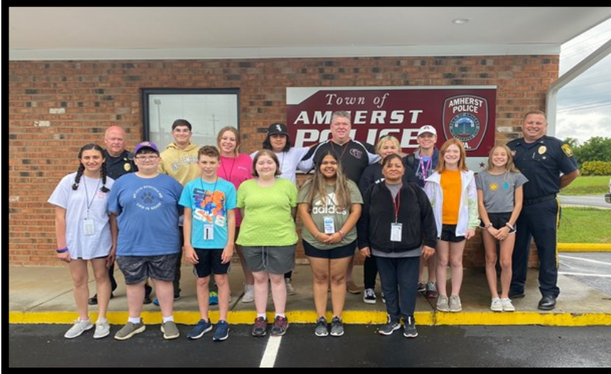
TVC Youth wrote letters to area Police Officer's and delivered the letters to them personally.