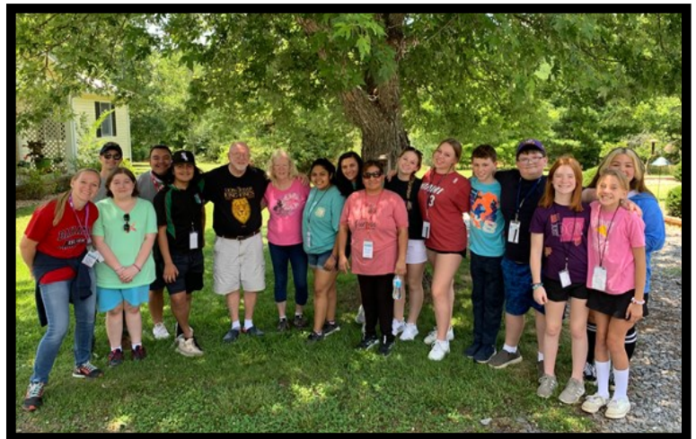
TVC Youth helped the Dahl Family with chores around their home in Lynchburg.