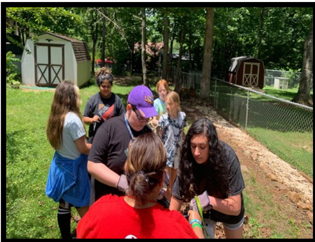
TVC Youth raked leaves for a 90 year-old widow living alone in Lynchburg.