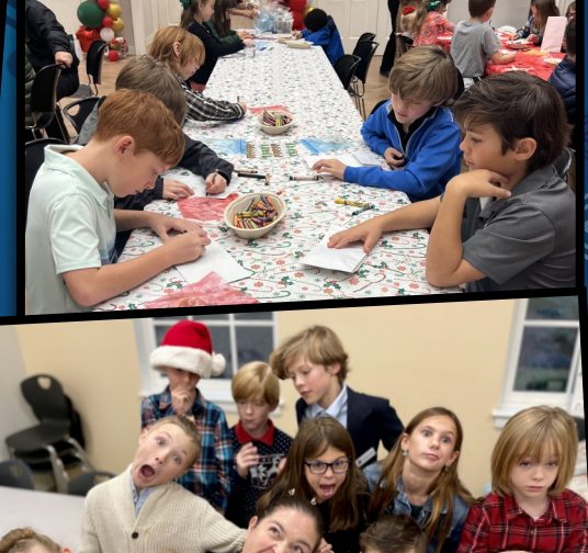
Santa came for a visit!