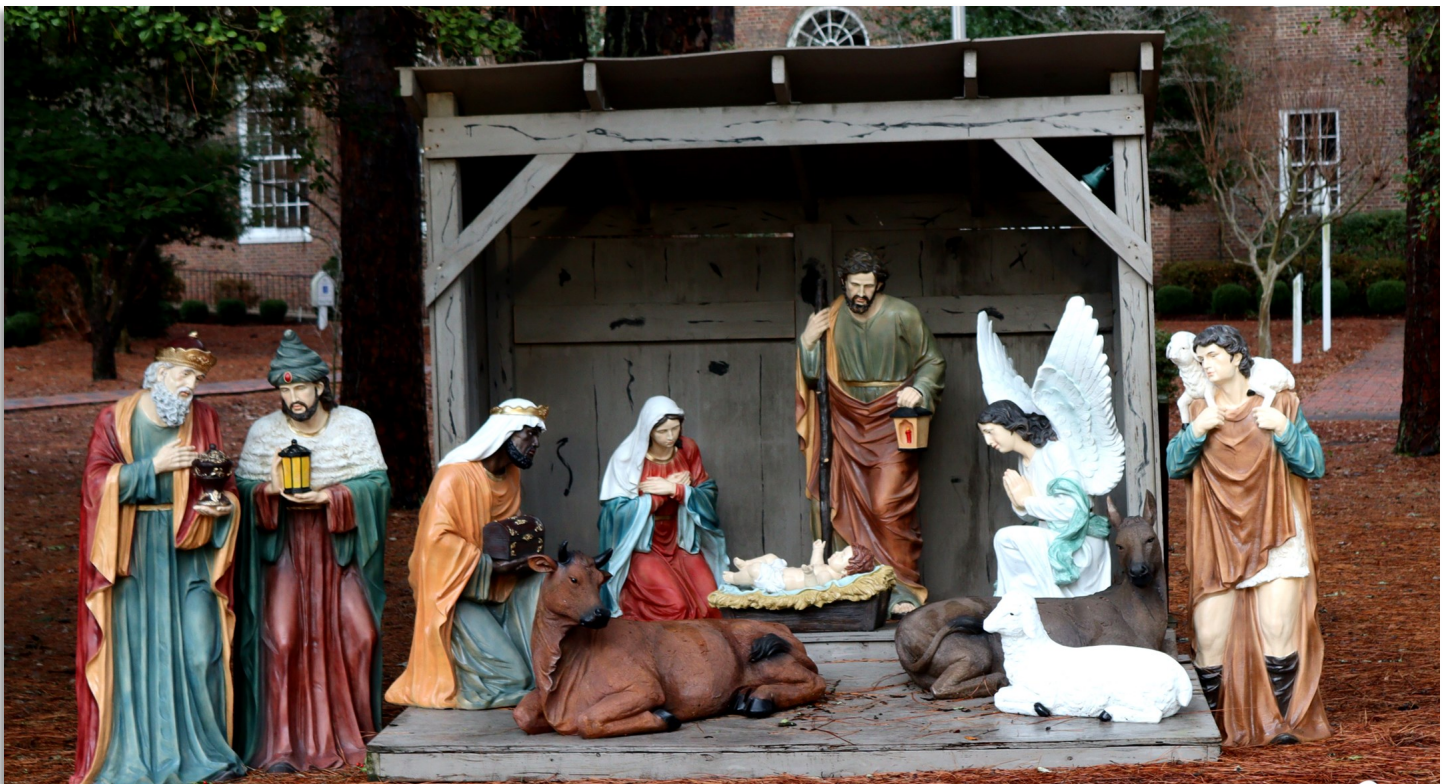
Once again this year The Village Chapel set up the Nativity scene in front of the church reminding us all of the true spirit of Christmas.