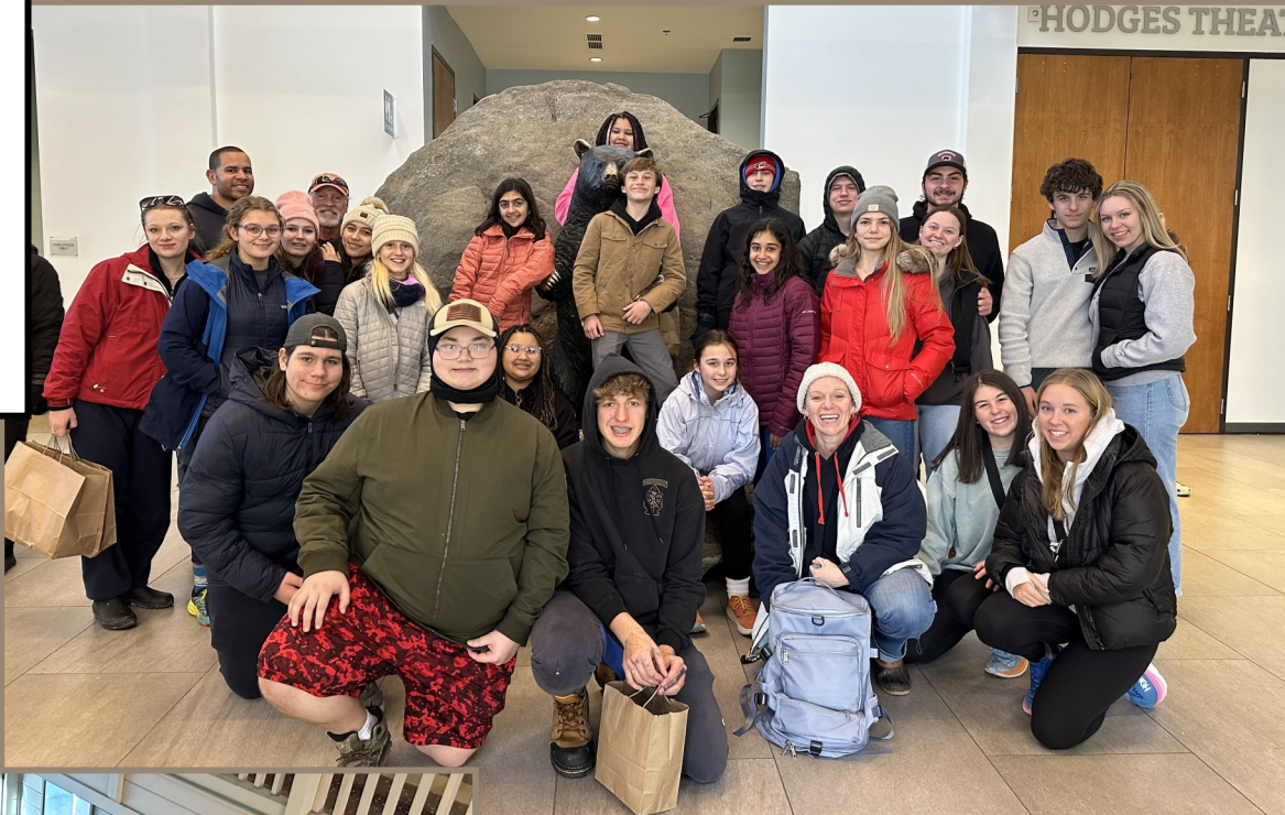
The TVC Youth Group had a memorable time together in Blowing Rock, NC.