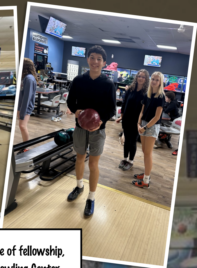
Recently, the Youth had a great time of fellowship, bowling together at the Sandhills Bowling Center