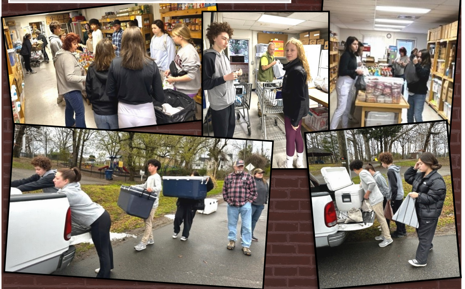
TVC Youth partner with Robbins area Christian Mission