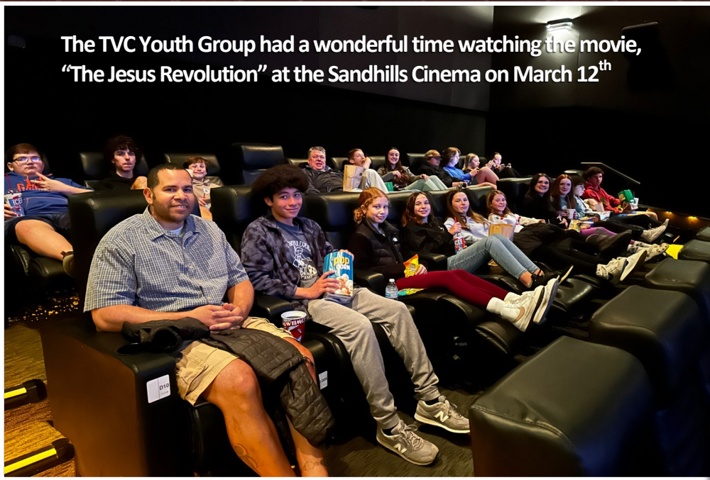
The TVC Youth Group had a wonderful time watching the movie, "The Jesus Revolution" at the Sandhills Cinema on March 12 th